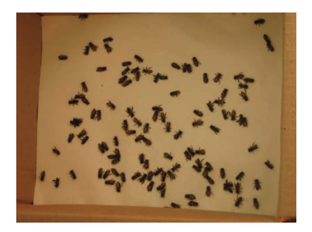
Fig. 1: Clustering experiment: initial distribution of bees. Some 120 cerana bees have been put to sleep with carbon dioxide and spread on the bottom surface of a container. The average spacing between nearest neighbors is 2.3cm. The temperature in the container is around 28 degree Celsius.