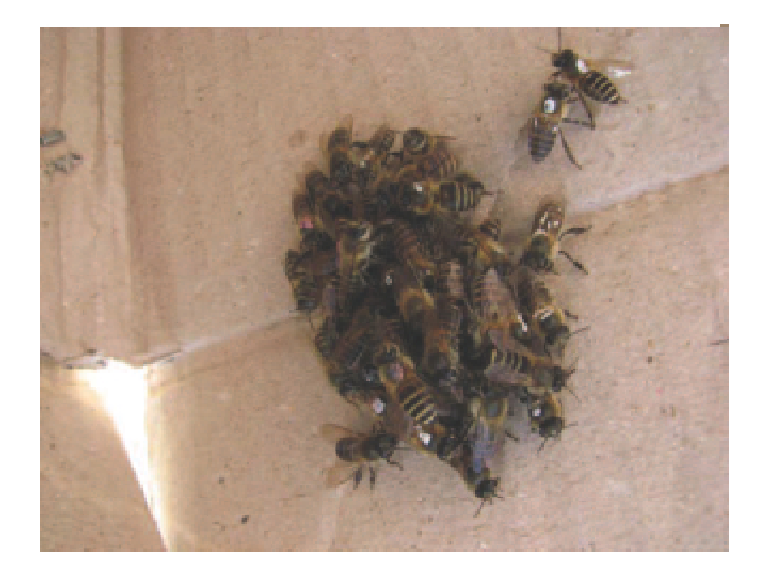
Fig. 3: Mixed cluster of bees. The bees from colony A are marked with a white dot whereas those of colony B have no dot. The picture shows that the cluster comprises bees from the two colonies.

Yet, observation instead showed that the bees form a mixed cluster (see Fig. 3). This