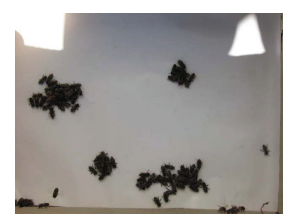
Fig. 2: Clustering experiment after 20 minutes. In the process which is under way the bees had first aggregated into many small groups and then these groups have been moving toward one another to form larger clusters until forming one single cluster at the end of the experiment (as shown below in Fig. 3).